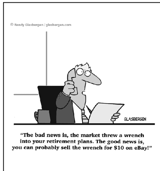
"The bad news is, the market threw a wrench into your retirement plans. The good news is, you can probably sell the wrench for $10 on eBay!"