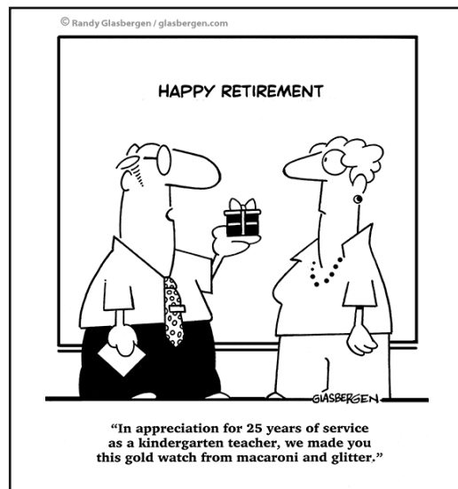
"In appreciation for 25 years of service as a kindergarten teacher, we made you this gold watch from macaroni and glitter."