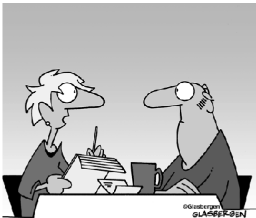
"We used up all of our retirement money. First our car retired, then our furnace retired, then our dishwasher retired...."